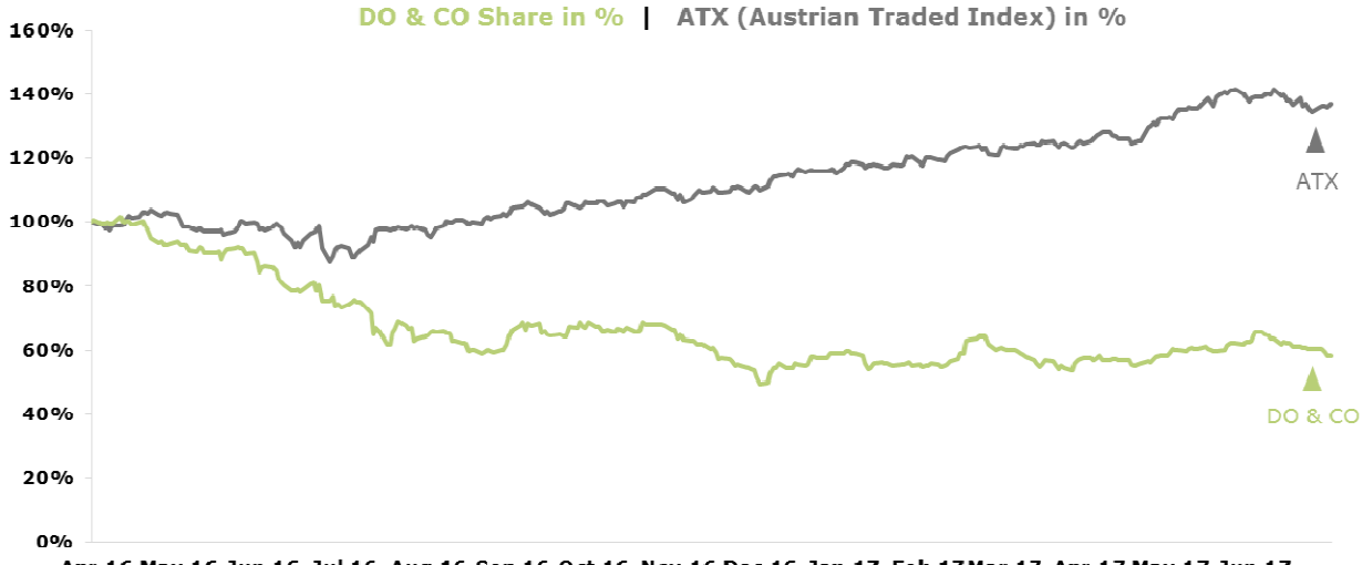
Apr.16 May.16 Jun.16 Jul.16 Aug.16 Sep.16 Oct.16 Nov.16 Dec.16 Jan.17 Feb.17Mar.17 Apr.17 May.17 Jun.17

On the Istanbul Stock Exchange, DO & CO's share gained 6.0%, closing at TRY 250.10 on 30 June 2017.