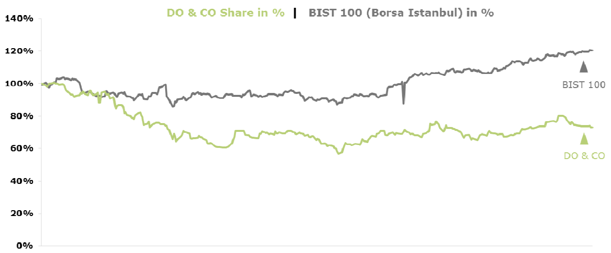
Apr.16 May.16 Jun.16 Jul.16 Aug.16 Sep.16 Oct.16 Nov.16 Dec.16 Jan.17 Feb.17Mar.17 Apr.17 May.17 Jun.17

On the Istanbul Stock Exchange, DO & CO's share gained 6.0%, closing at TRY 250.10 on 30 June 2017.