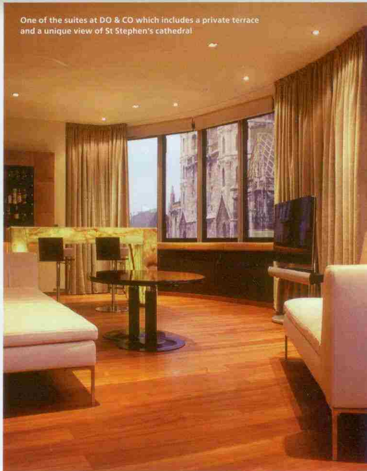
One of the suites at DO & CO which includes a private terrace and a unique view of St Stephen's cathedral