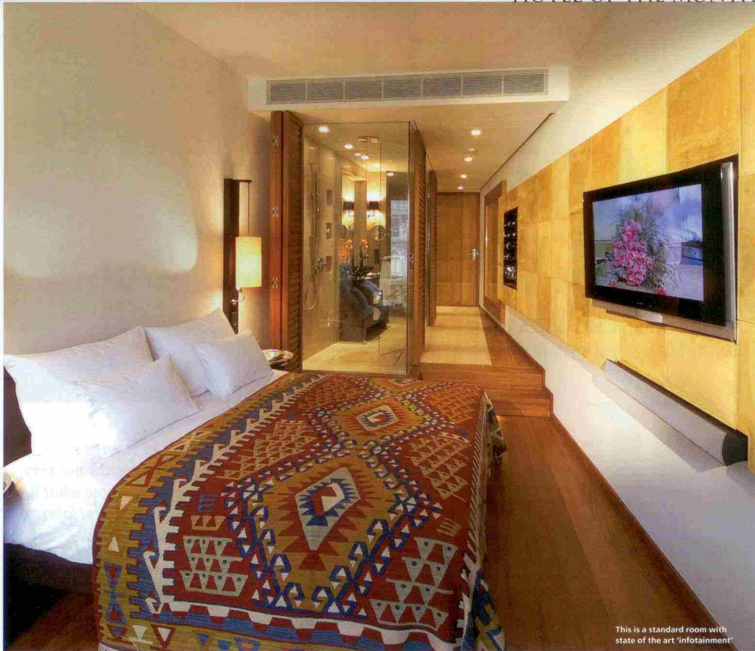
This is a standard room with state of the art 'infotainment'

on the 3rd – 6th floors within the Haas Haus building, which is an icon for modern architecture in the city. DO & CO comprises 41 double bedrooms including two exclusive suites with their own Onyx bar and Jacuzzi.