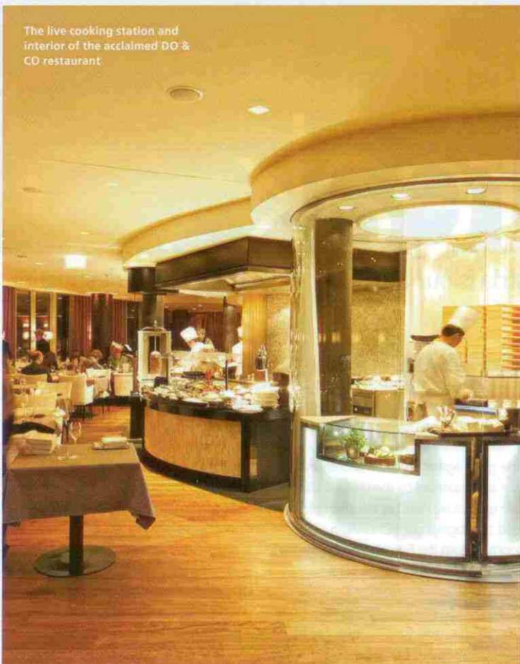
The live cooking station and interior of the acclaimed DO & CO restaurant